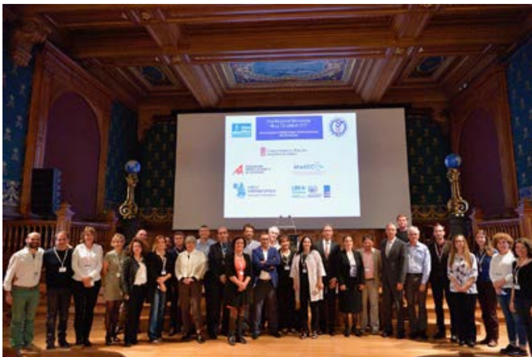
Participants of the regional Workshop on "Human impacts on Mediterranean marine ecosystems and the economy", Musée océanographique de Monaco, 17-18 October 2017

This document analyses the main threats, vulnerability and ecological and human impacts. On the consensus of a wide range of specialists in different disciplines then some responses and policy options as well as main knowledge gaps and needs are proposed as conclusions for Mediterranean decision makers.